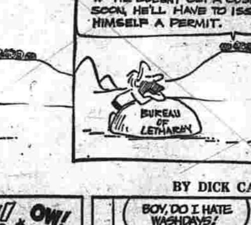
BY JOHNNY HART