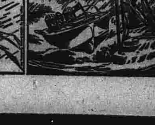
BY LEFF and McWILLIAMS